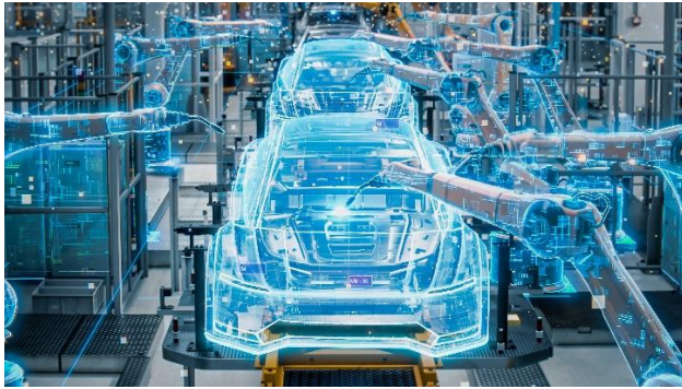
Image 3: TSN can cater to even the highest real-time communications demands of industrial automation applications.

The image(s) distributed with this press release are for Editorial use only and are subject to copyright. The image(s) may only be used to accompany the press release mentioned here, no other use is permitted.