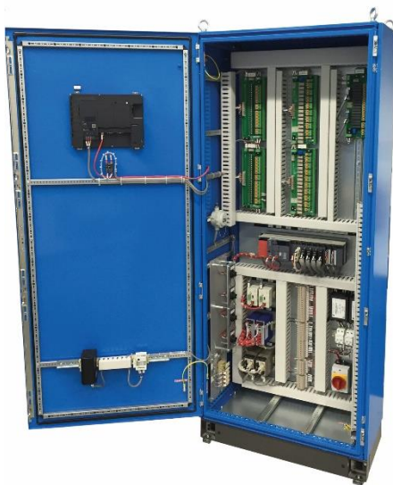
Image 3: To ensure reliable and fast inter-substation data transfer, a proven high-bandwidth open network technology, such as CC-Link IE, was needed.

Keywords: High Speed Two (HS2), London Euston station, CC-Link IE, rail network, traction and electrical power, traction power control.