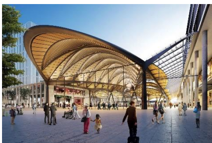
Image 1: The technology used to deliver an exceptionally reliable and accessible high-speed network for accommodating the High Speed Two (HS2) railway line at London Euston station was the open gigabit industrial Ethernet solution, CC-Link IE.